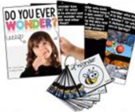
TEXT & ACTIVITY