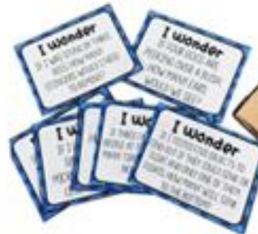
REVISIT DAY 3 MATH & ELA EXTENSIONS